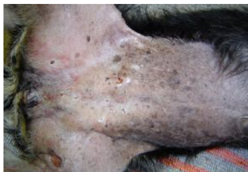
4 Days and 3 phototherapy sessions later