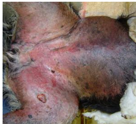
12 hours and 1 phototherapy session later