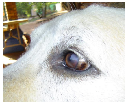
7 Light therapy sessions later